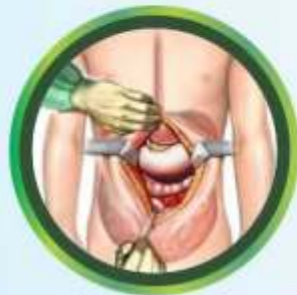
Intra Abdominal Sepsis