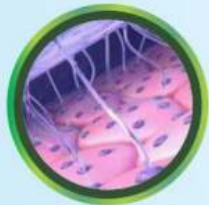
Urinary Tract Infections