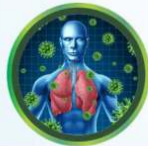
Pneumonia & Bronchitis